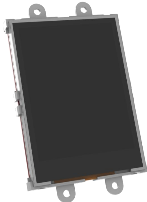
The uLCD-24-PTU Display Module